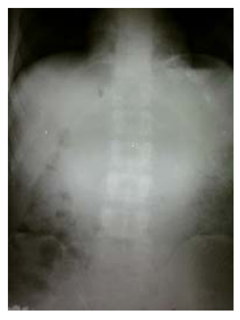
Figure 1. Scout film abdomen in upright position showing multiple fluid levels.

Mid line vertical laparotomy was done. A defect of 5 cm diameter was found in the mesentery of ascending colon. The entire small gut except the proximal 15 cm of jejunum and terminal ileum had herniated through the