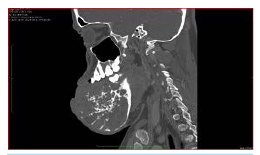
Figure 2. Axial and sagittal of images showing a large expansile osseous mass arising from mandible with associated soft tissue component.