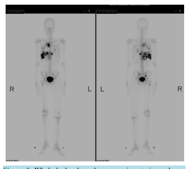
Figure 2. Whole body planar bone scan in anterior and posterior views showed multiple tracer uptake in the right border of scapula, left midshaft of humerus, in the thoracic cavity, multiple bilateral ribs, in the pelvic bones, spine and proximal right femur. There is also a photon deficient area in the left femur in keeping with previous implant.