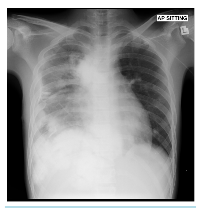
Figure 1. Chest X ray showed right pleural effusion with underlying right lung collapse. Several nodules of varying sizes are also seen in the left lung.

Distal femoral and proximal tibial metaphyses are the region, which is most commonly affected. These are the regions of the greatest growth rate. It is followed by knee, proximal humeral metaphysis and diaphysis and pelvis.