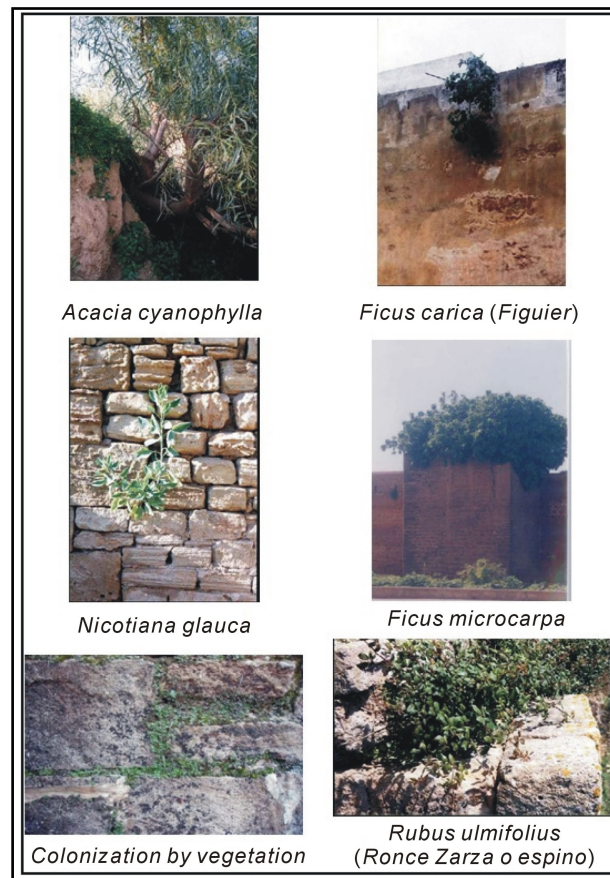
Figure 2. Some species growing on the walls.