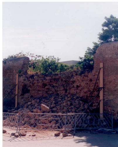
Figure 3. Thrashing has the effect of tree roots (Wall of Rabat).