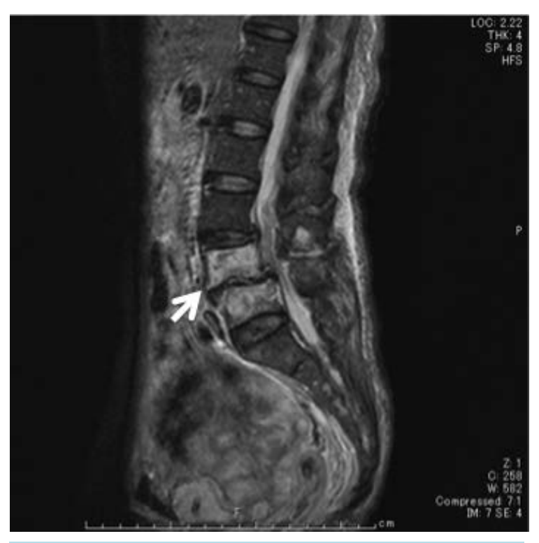
Figiure 1. MRI image showing inflammatory changes at the level of L4/5 (arrow).

Vitreal fluid aspirated from both eyes was purulent, but there was no growth from both direct and enriched cultures. Spinal tap was also performed but cerebrospinal fluid cultures were negative either. Fine needle biopsy of the spine was not performed. Magnetic resonance imaging (MRI) of the head was unremarkable, but spinal MRI, requested to investigate back pain, revealed surrounding inflammatory changes extending into both adjacent vertebral bodies at L4/5, in keeping with infective spondylodiscitis ( Figure 1 ). The <sup>67</sup>Ga scan showed areas of increased uptake around both eyeballs and lumbar vertebrae ( Figure 2 ).