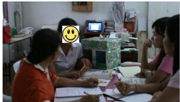
Figure 6. Lesson planning in how many and how many (4).

3) Teacher tells students that "today I want you to drop ping-pong ball. When they dropped the ball, little detectives record number of the balls in record card. Then, she informs how to record number of the balls in record card.