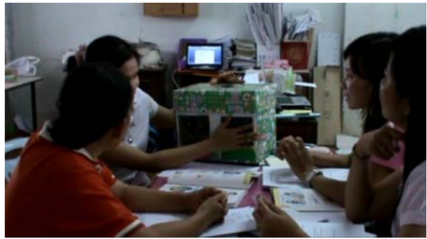
Figure 1. Lesson planning in how many and how many (1).

Item 6: If I bring the nearby, I'm afraid of getting similar activity. Firstly, separating 5 further. If I separate 6, I'm afraid the students would remember the answer. The first period is to separate 5 number. We have this kind of box for one box. Our goal is: we want the students to know that 5, what is structure of 5. It consisted of 1 with 2, with 3, with 4, with 5, with 0. Separate 5 into 2 numbers. We tried not to emphasize students to remember, isn't it? It seems that when the students see 5, they see 2 things. It might be 1, 4 or 2, 3. The students should