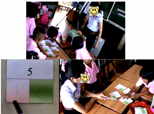
Figure 5. Classroom activities.

this. It comes from 0 and 5. But, if we do not give the children, If some children get 4 and 1. Is it the same as 5 and 0?