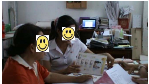
Figure 2. Lesson planning in how many and how many (2).

know that 5 could come from what. Is it the same box as the last year?