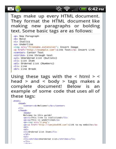
Figure 1. iWebkit user guide.

comes with iWebkit. Preloaded HTML codes are provided that can be customised for example including a link to a radiology image with associated text.