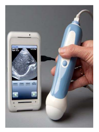
Figure 4. Mobisante ultrasound device.