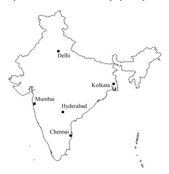
Figure 1. Geographical location of Delhi, Mumbai, Kolkata, Chennai and Hyderabad on the physical map of India.

The climate of Delhi is a monsoon-influenced humid subtropical climate. Summers start in early April and peak in