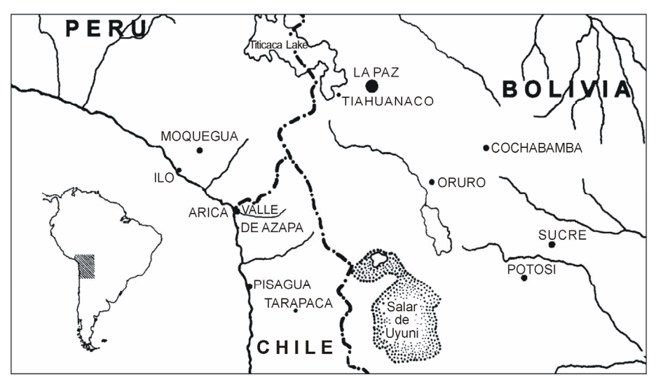
Figure 1. Map of South Central Andean region with study sample locations and relevant geographic places.

In order to evaluate the biological relationships between the Cochabamba and Arica groups, we compared the Formative and Tiwanaku period groups from Cochabamba to those of the Late Archaic, Early Intermediate, Middle and Late Intermediate, and Late periods of the coast and valley sites of the Azapa region. To achieve this we employed multivariate analysis of variance, canonical discriminant analysis and Mahalanobis' D2 distance statistic (Rao, 1952; Seber, 1984). To display the results graphically a cluster analysis was performed (Kaufman & Rousseeuw, 1990) using the UPGMA method and the previously calculated distances.