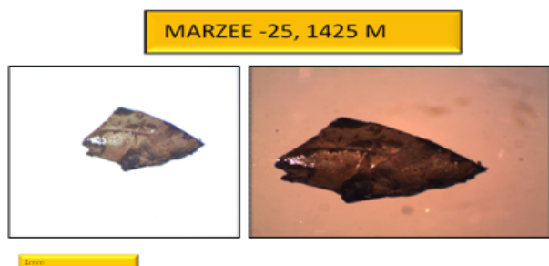
Figure 3. Microphotograph of oil mineral aggregates obtained from surface sediments from the continental slope of the NW Gulf of Mexico.

The Mexican waters and coastal environments in the GOM have been internationally recognized for its megabiodiversity. These habitats are home to over 15,000 species of flora and fauna and many of them have considerable commercial value. That is the case of the penaeid shrimp populations exploited in the offshore waters of Tamaulipas, Veracruz, Campeche and Quintana Roo. Other important fishing resources of high economic value are the pelagic stocks of red snapper, grouper and tuna. The blue crab, oysters, and clams, which are normally exploited in the complex lagoon systems around the gulf (Laguna Madre-Tamiahua-Alvarado), constitute vital artisanal fisheries. All these marine living resources are highly vulnerable to toxic compounds incorporated into