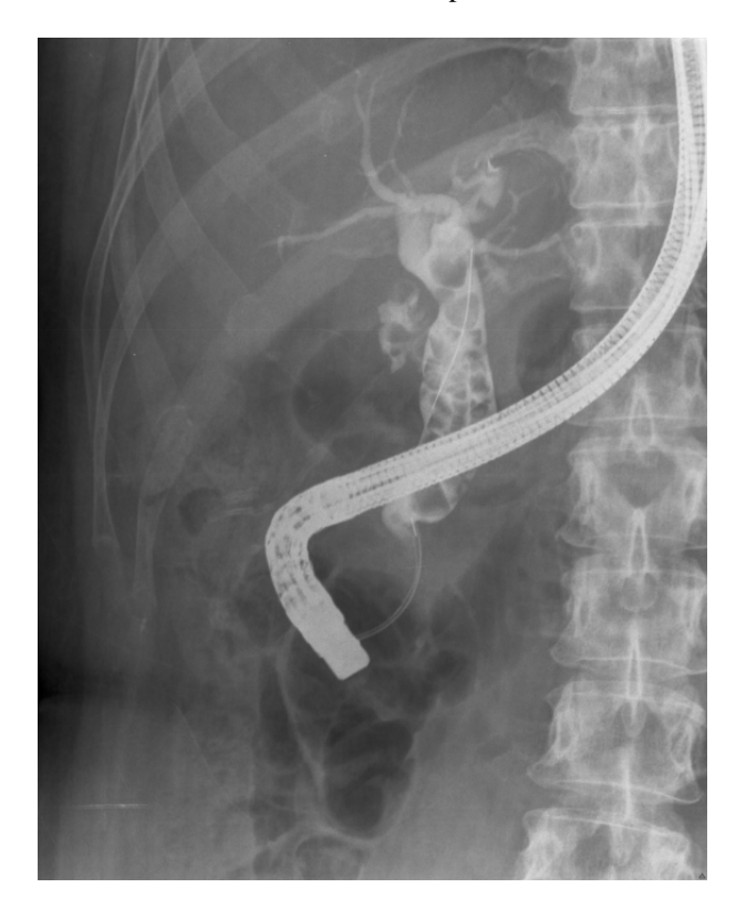
Figure 1. Multiple and big bile duct stones.

A prospective study was made of 153 patients diagnosed with choledocholithiasis in Miguel Servet University Hospital (Zaragoza, Spain) during the period between January 2009 and November 2011. All of the patients were subjected to ERCP with ES. Fifty-two of them moreover underwent SP after ES, and were compared with the 101 patients of the control group, subjected only to ES. The indication of one technique or other depended on the criterion of the endoscopist, after evaluating the difficulty of stone removal. Written informed consent was obtained from all patients at least 24 hours in advance. Antibiotic prophylaxis in the form of intravenous amoxicillin-clavulanate was provided according to the protocol used in our hospital, unless the patient had already been receiving broader spectrum antibiotics. In patients with allergy to betalactams, amoxicillin was replaced with ciprofloxacin plus metronidazole. The procedure was carried out under sedation with midazolam and intravenous fentanyl, administered by the endoscopist, with the monitorization of oxygen saturation and heart rate. Intravenous buscapine and atropine were also administered. The canulation was performed with 0.025