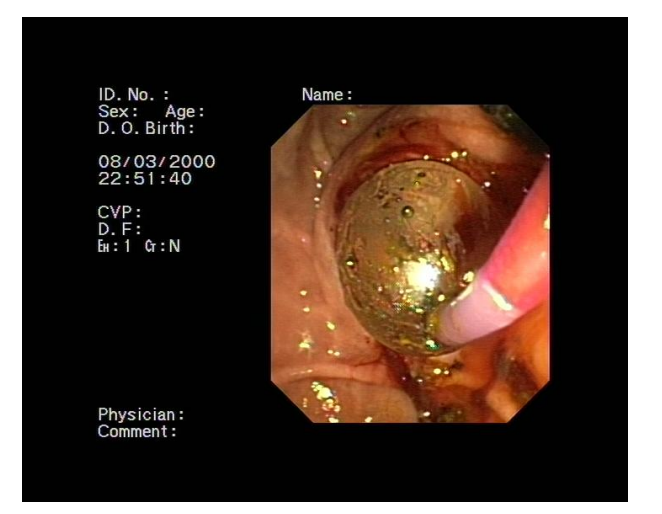
Figure 2. Sphincterotomy and sphinteroplasty with large caliber balloon.

Technique: need for precut, performance of SP after