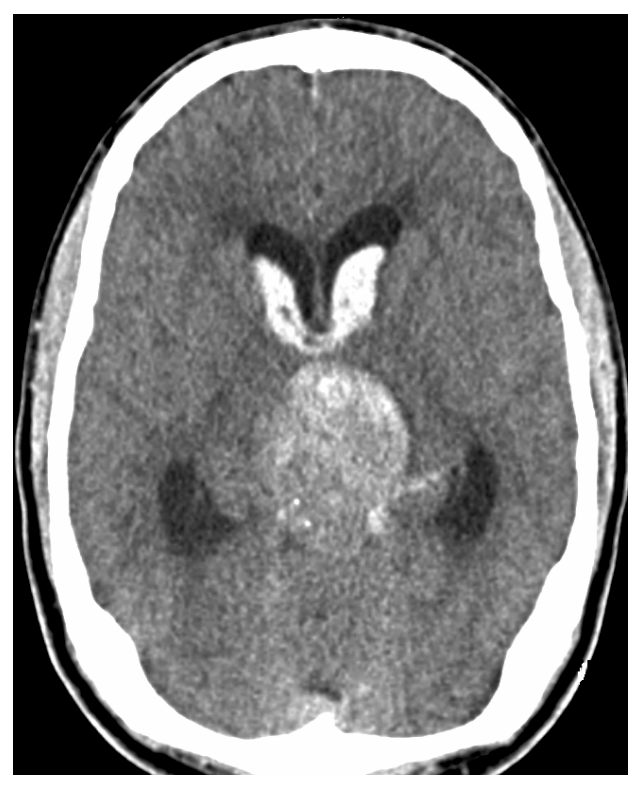
Figure 2. CT contrast brain: Diffuse enlargement of pineal tumour secondary to large intraparenchymal haemorrhage with intraventricular extension and acute hydrocephalus.

ramina of Monroe and overlying the third ventricle stoma. This prompted placement of a left frontal EVD.