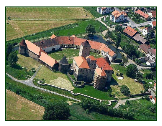
Figure 3. Reconstruction of the fortification wall.

Švihov is not as outstanding as Český Krumlov and financial resources were thus more difficult to find. Thanks to the good management and the personal commitment of the mayor, the town received millions of Czech crowns from EU funds, charity contributions and Czech Government support. The local authorities in Švihov started immediately on renewal and remediation. Within just two months after the flood, the Švihov Municipal Authority called on all relevant authorities, institutions and companies to take part in developing a flood protection study for Švihov (Figure 4). They were all working together on the project and developed two versions. The last word was then given to the public who decided to realize the more expensive but more architectural and historical friendly version. Instead of building new earth embankments the option of rehabilitation of the old fortification was chosen. Part of the discussion was also about where to find funding, as the castle-friendly version was ten times more expensive than the original suggestion of a protective rampart. With only one or two