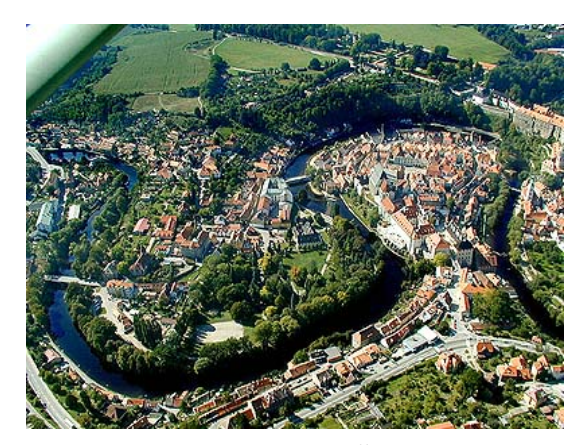
Figure 1. Meanders of the Vltava in Český Krumlov.

tional problems. The greatest loss was noticed on interior equipment. We assume that houses were built with awareness of flood danger so the constructions were stable enough to survive. In the past, the ground floors of the buildings were usually used for service and work purposes, in order to minimize the losses when there was high water. Valuable property was kept in the upper floors. Nowadays, the ground level is usually used for commercial activities—shops, restaurants, hotels, art galleries, etc. These spaces are loaded with goods that are not tolerant to water damage.