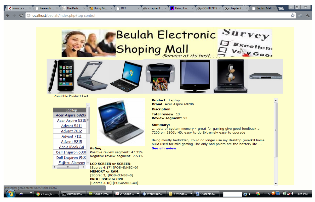
Figure 4. Online shopping mall review page.