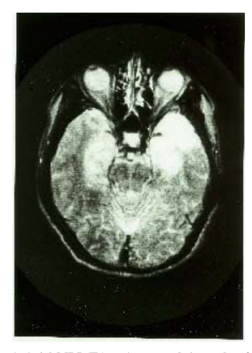
Figure 1. Axial MRI (T_1) at 1 year and 6 months after the onset of herpes encephalitis.

High-intensity areas were observed over a wide basilar to anterior area including the hippocampus on the left side as well as to one-third of the medial region on the right side of the anterior temporal lobe ( Figure 1 ). At eight years and seven months after the onset of herpes encephalitis, damage was still recognized over a wide range on the left side, including the parahippocampal gyrus, the hippocampus, the spindle gyrus, and the amygdaloid complex. On the right side, smaller lesions were present in the parahippocampal gyrus extending to the antero-interior rim, but the damage to the right hippocampus was assumed to be slight ( Figure 2 ).