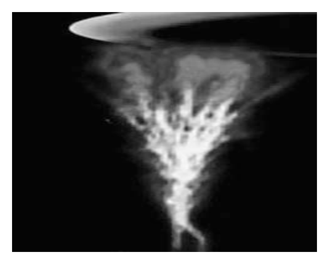
Figure 2. Photo of "Jet".

information to the present time is accumulated about Sprite. Jet and its physical examination is the most interesting stage of the work for the future.