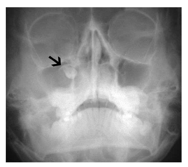
Figure 2. Water's projection highlighting the superior limit of the lesion (black arrow).