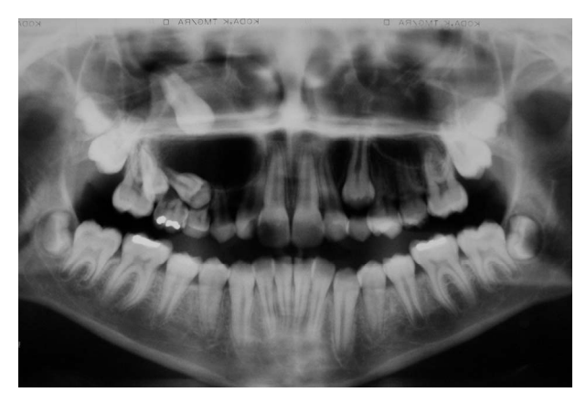
Figure 1. Panoramic radiograph showing a well-circumscribed unilocular radiolucent area extending from tooth 12 to 17, displacing the canine and premolar teeth.