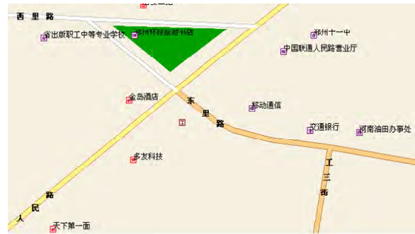
Figure 3. The effect of application based on Annotation algorithm

tion methods which are previously described Applications previously described and the operation effect of vehicle navigation system is shown in Figure 3. It is based on the web user's demand for vehicle navigation and provide vehicle navigation, information search and retrieval functions.