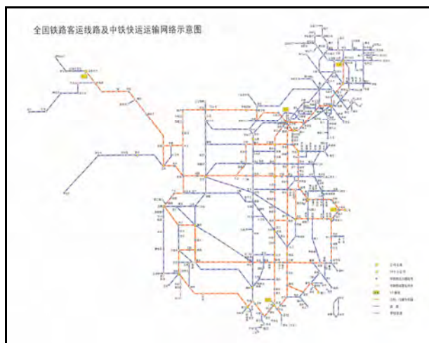
Figure 1. The national railway line and the CTTNs diagram of China