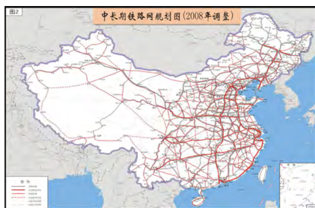
Figure 2. The national railway planning diagram of China