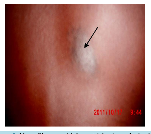
Figure 1. Neurofibroma with hypertrichosis on the back.