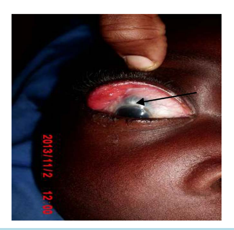
Figure 4. Lisch nodule.