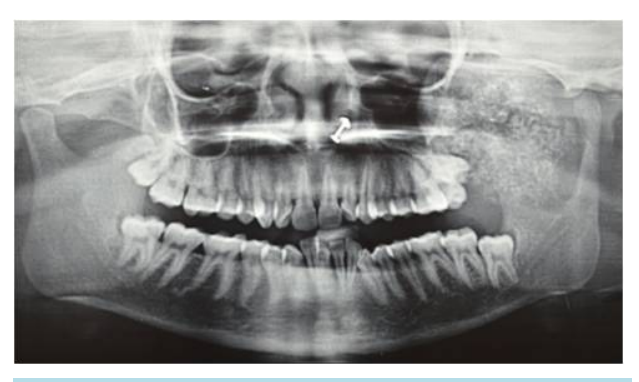
Figure 2. OPG showing mass in infratemporal region.