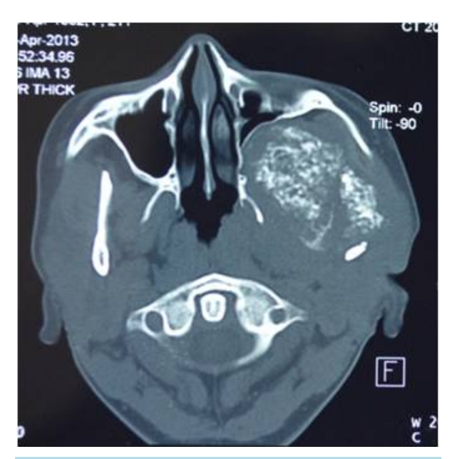
Figure 3. CT axial view showing big mass in the infratemporal region.

whole infratemporal fossa involving maxillary tuberosity, infratemporal surface of temporal bone and mandibular ramus area. A nonenhancing mass with mottled calcification was seen in the axial section measuring 5 \times 5 cm in size. The classic sunburst appearance is also seen ( Figures 3 and 4 ). An incisional biopsy was then done. Histologic examination revealed a biomorphic tumor displaying areas of well differentiated cellular hyaline cartilage surrounded by small undifferentiated tumor cells that exhibit a hemangiopericytoma like pattern of arrangement ( Figure 5 ). The cartilaginous areas show prominent calcification with focal evidence of ossification. Tumor infiltration into bone is noted. Immunohistochemistry was done and the chondrocytes were positive for S100. Histopathology was suggestive of MS. The patient underwent surgery and chemotherapy.