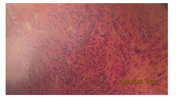
Figure 3. Microphotograph showing the immunohistochemical appearance.

otrexate with leucovorin, doxorubicin, cyclophosphamide, vincristine, prednisone, and bleomycin-a third-generation HL-NHL regimen) or ABVD (doxorubicin, bleomycin, vinblastine, and dacarbazine-a scheme specific for HL) [21]. Complete response (CR) rates in both arms were in excess of 90%, with an approximately 90% chance of being relapse free at 32 months. Unfortunately, we now know that most cases of ALCL-Hodgkin like are actually HL, making the results of that trial difficult to interpret. A French series contained a subset of patients with ALCL treated with three cycles of ACVBP (doxorubicin, cyclophosphamide, vindesine, bleomycin, prednisone) chemotherapy followed by a consolidation phase with high dose methotrexate, ifosfamide, etoposide, asparaginase, and cytosine-arabinoside or eight cycles of m-BACOD (methotrexate, bleomycin, cyclophosphamide, vincristine, dexamethasone) [22]. The CR rate was 69% for the T-cell subtype with an estimated 5-year OS rate of 63.2%. In an Italian series that stratified patients by ALK expression, the overall response rate (ORR) for ALK+ patients was 92.3% (77.3% achieved a CR), where- as the ORR in ALK- patients was 84%, with only 56% achieving a CR [10]. Because of the heterogeneity of re- ports in the literature and lack of systematic trials, the US standard has generally been to treat ALCL with CHOP chemotherapy. The choice of CHOP is largely an extrapolation from the DLBCL literature. Studies in DLBCL