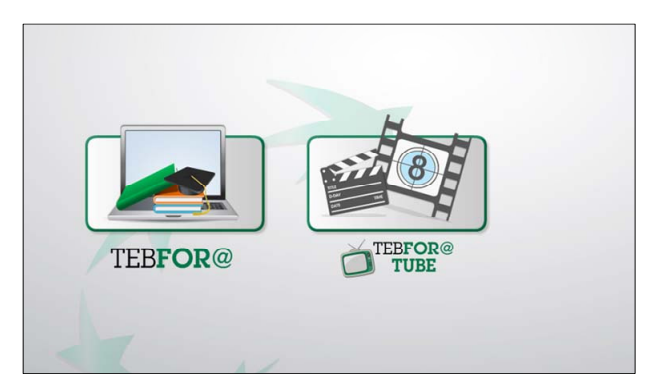
Figure 1. General appearance of the online learning platform used in the bank.

4) Personal development: These are catalog courses that aim to improve one's soft skills through his/her professional life. Some of these courses can also be accessed from the online performance management tool based on the specific targeted skills of the employees.