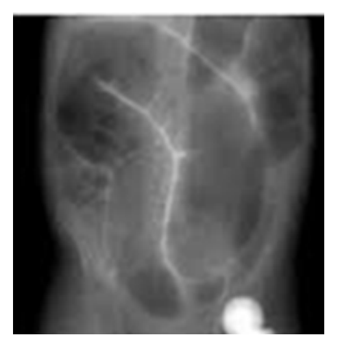
Figure 3. ASP double jamb image case 2.