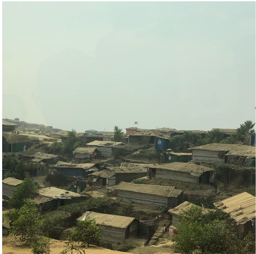
Figure 3. Camp #4 Rohingya Refugee camp, Cox's Bazar (Source: A Goodman, February 2019).

One aspect of Rohingya persecution has been targeted sexual and gender-based violence (Human Rights Watch, 2018). Gender-Based Violence (GBV) is defined as a violation of universal human rights protected by international human rights conventions, including the right to security of person, the right to the highest attainable standard of physical and mental health, the right to freedom from torture or cruel, inhuman, or degrading treatment, and the right to life (IASC, 2015).