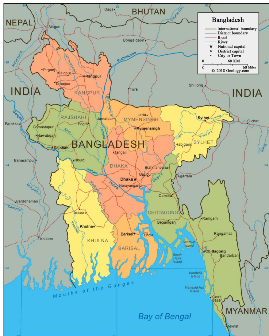
Figure 1. Map of Bangladesh. (From Geology.com, https://geology.com/world/bangladesh-satellite-image.shtml ).

Bangladesh has intermittently received Rohingya refugees fleeing from Myanmar since World War two (Milton et al., 2017). There have been multiple Myanmar military actions against Rohingyas with more than twenty years of continuous Bangladesh camp settlements. Amnesty International summarized the timeline of Rohingya displacement to Bangladesh (Amnesty International, 2017). In 1977-1978, up to 200,000 Rohingya initially fled Myanmar to Bangladesh