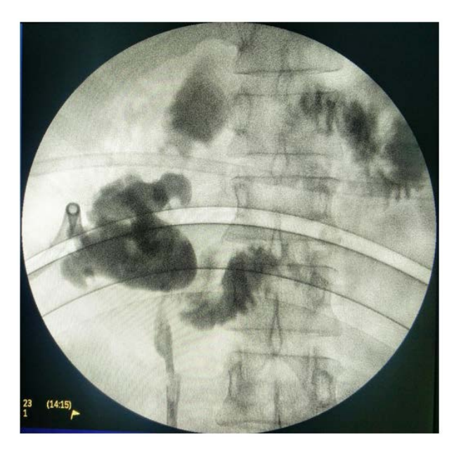
Figure 3. Post-operative RGP shows contrast leaking into the second part of duodenum.

a total of 5803 patients, of whom 865 (16.2%) had a positive urine culture. The most common organism isolated was Escherichia coli (Gram negative), which was found in 350 patients (6.5%). Post-PCNL fever was noted in approximately 10% (550) of the cases, although the patients received antibiotic prophylaxis. The percentage of post-PCNL fever in patients with negative preoperative urine culture and positive preoperative urine culture was 8.8% and 18.2%, respectively. Postoperative PCNL fever was significantly increased with the increasing mean durations of hospitalization (3.4 days \pm 1.7 days vs. 5.4 days \pm 2.3 days; p < 0.001). Postoperative fever was frequently observed in cases with nephrostomy tube placement and in women because the nephrostomy tube, which was used in complicated cases, acted as a foreign body and females have greater risk of UTI. Both studies demonstrated the importance of preventing infection-related complications following PCNL.