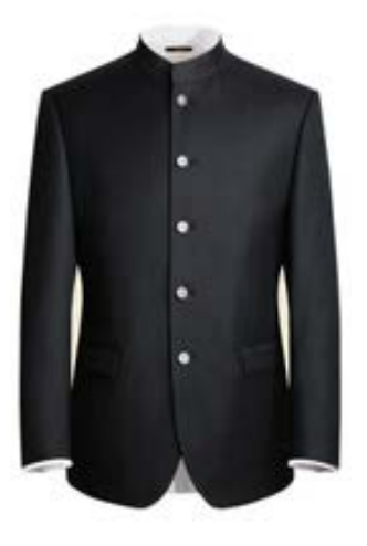
Graph 2. Chinese tunic suit.