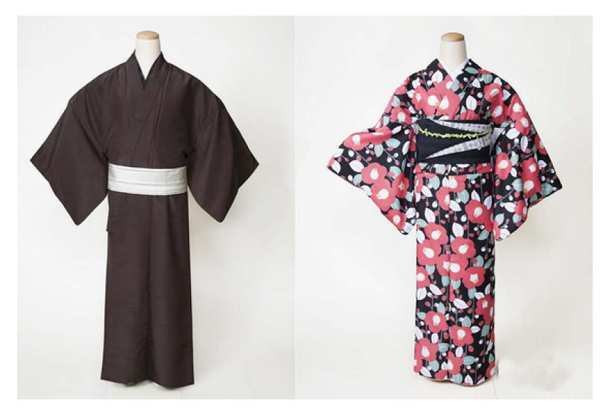
Graph 3. Samples of Kimono.

Recently, due to the limitation of wearing methods and occasions, less people are buying and using the traditional kimono. And the new kimono of yukata and haori are more popular. They shorten the length and simplify the accessories on the traditional basis. And the brocade is replaced by the cotton for decreasing the cost and facilitating the wearing. In addition, the washer wrinkle fabric is of unique attraction. These standardized new kimonos in garments with characteristics are similar in styles with the traditional kimono but with simple accessories and low price, which are popular among the young people. Graph 3 shows the samples of Japanese Kimono.