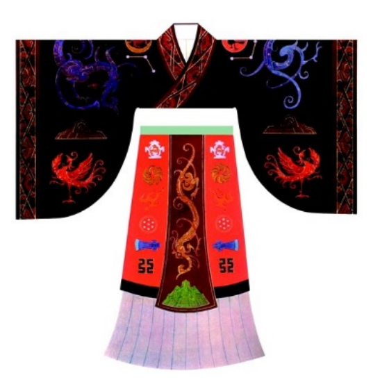
Graph 1. Traditional Hanfu.

As the card of clothes of culture, courtesy, art and traditions in Chinese nation, nation wear is expected to carry the unique cultural feature, the superb level of aesthetics, extraordinary techniques and rich pragmatic values in life. Meanwhile, nation wear in modern society need to combine the traditional elements and absorb different cultures, modern lives and work styles including the recognition of images in Chinese culture from home and abroad and the identity of the national spirit consisting of multi-ethnic groups.