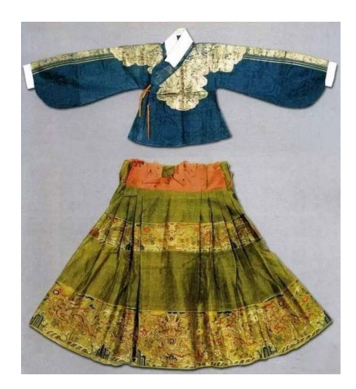
Graph 4. Samples of Hanbok.

The unified language in clothes is crucial for popularizing the culture of nation wear and regulating the market. Based on the classification standards of nation wear and the coding theory of components, we can make related standard language with national standard modes, which can be complementary strategies for the standardization of the image of nation wear.