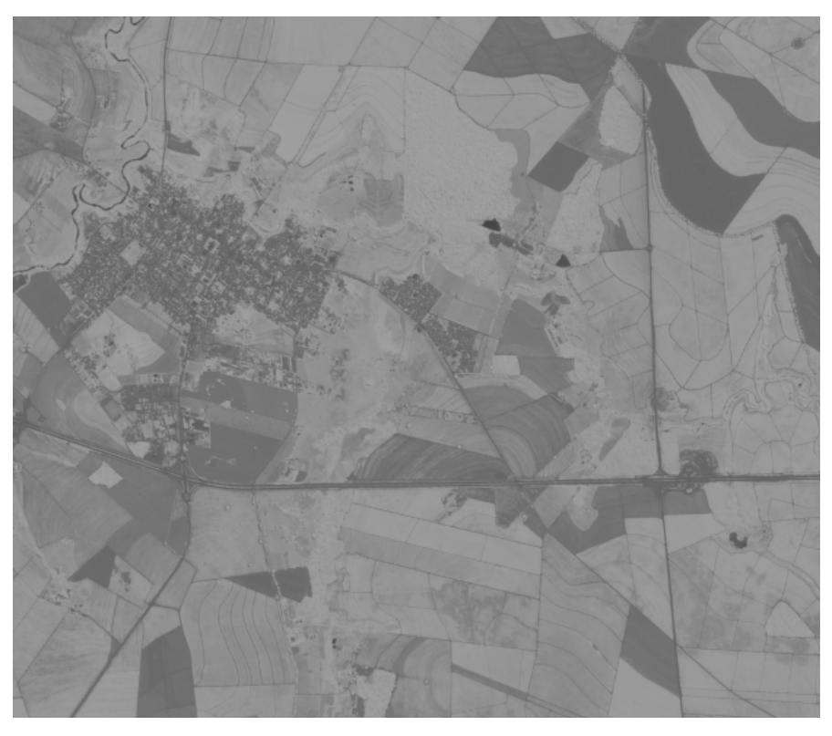
Figure 3. Monochromatic results achieved with cmNDVI for study area.

Although it is possible to identify features such as road and urban regions in the resulting monochromatic image, we performed a transformation of the dynamic range into color scale image. Figure 4 represents this color map transformation, where we can clearly see targets that do not pose vegetation areas in purple and dense vegetation coverage in dark green. These labels are based on