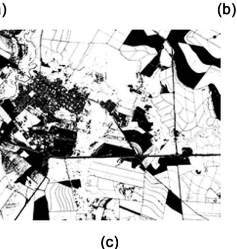
Figure 5. Binary images from automatic thresholding process for green area calculation, where in black are the excluded pixels that do not pose interesting areas: (a) CARTOMORPH results; (b) SPRING results and (c) ENVI results.

Table 1. Comparison of green area estimation for CARTOMORPH, SPRING and ENVI software.