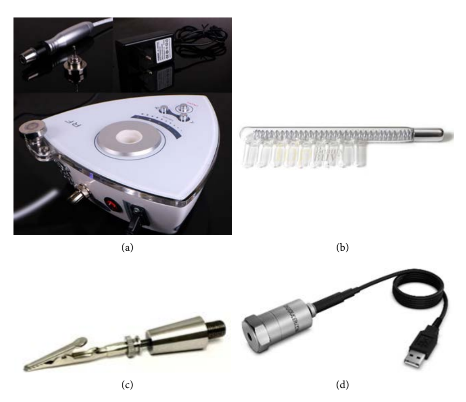
Figure 1. (a) Mini RF Bipolar Radio Frequency; (b) D'Arsonval High Frequency Device; (c) Screw-mounted micro-clamp; (d) USB Digital Accelerometer.

to find a clamp that can hold the shard tightly so as to prevent the shard's wobbling, which can produce distracting background vibrations. The clamp can reduce vibration at the point of contact, soit is important to choose a clamp with as small of a clamp footprint as possible in order to prevent damping of the vibrational signature. One should be sure to use clamps that are non-crushing in order to prevent damage to the pottery shards.