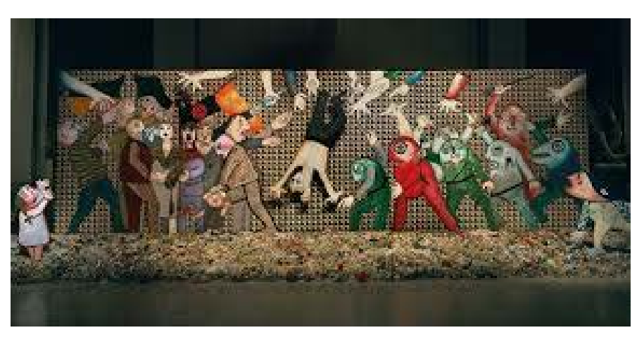
Figure 3. Enrico Bay's painting "Funerali dell'anarchico Pinelli" (1972).

Two international museums in Europe have already expressed to Pinelli's family their willingness to display the painting permanently; but of course it is a very important symbol for the public memory in Milan. That it should remain in Milan is generally agreed by Milanese citizens and Pinelli's relatives. Hence further negotiations with Milanese political and cultural institutions will be needed to find a stable destination for this very controversial artwork and a final solution seems to be still far away. The difficulties (almost fifty years after Pinelli's death) to find out a possible location for this painting represents an eloquent indicator of the degree of controversy still linked to this case. In Milan to expose this painting-the painting of a man, Giuseppe Pinelli, who died innocent and was therefore defined as the "eighteenth victim" of Piazza Fontana by the President Giorgio Napolitano-can still mean to "blame" Luigi Calabresi's reputation and to offend his relatives. If one does not consider the contemporaneity of the failed attempts to find a location for Enrico Baj's painting and the release of Giordana's movie one cannot really understand how courageous and important the Italian film director was.