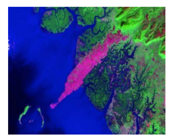
Figure 1. Satellite picture of the dunite of the Kaloum peninsula, Guinea, West-Africa the length of the (reddish) dunite body is appr. 50 km.