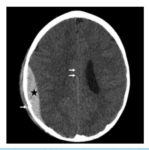
Figure 1. Cerebral scan without iodinated contrast injection: Axial-parenchymal window cut showing a spontaneous hyper density right temporal extra axial, bi-convex lens corresponding to an extra-dural hematoma right temporal (a star) in front of a fracture line (put a bone window and show) (b, arrow), and a mass effect on the right lateral ventricle (a, double arrows).

At cerebral level, the correlation was poor (0.242), with 8 computed tomography lesions out of 23 symptomatic patients for this level. One asymptomatic patient had an injury type of oedema-hemorrhagic contusion. This lesion is small in our study. This observation is comparable to that of TURCK et al. who found 100% of a VPN compared to CT that we compare to the gold standard diagnosis [9]. According to STIELL et al. , minor cranial traumas do not require scanner if their conscience to the Glasgow Coma Score is 15, if they do not vomit more than once if they have no signs of skull fracture. Thus, it is probably necessary to perform a brain CT to stable trauma patients whose clinical examination is totally negative, namely, no initial loss of consciousness, a Glasgow Coma Score at 15, no pupil abnormality, no headache, no trace of cranial impact [15]. Figure 1 shows an extra dural hematoma that was symptomatic.