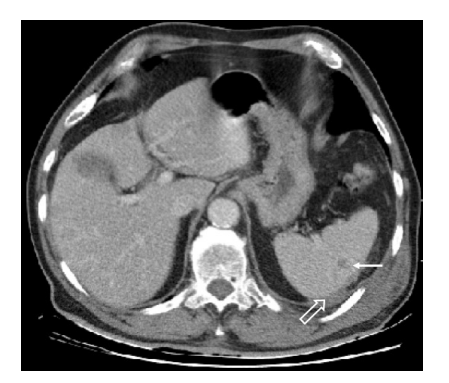
Figure 3. Abdominal scan with injection of iodinated contrast agent (portal phase): axial parenchymal window cut showing a small home of splenic contusion (full arrow), with discrete subcapsular hematoma (open arrow) from the vascular pedicle distance.

Figure 2. Cervical Scan without iodinated contrast injection: Axial bone window cut showing a right corporeo-laminar fracture of C3, unstable look (arrows).