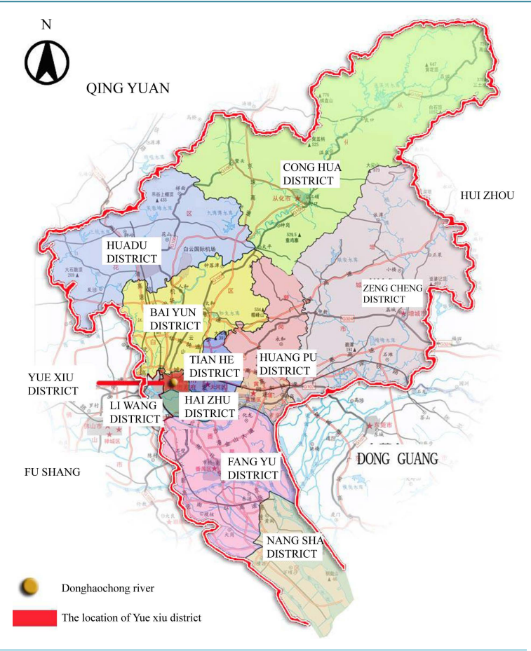
Figure 1. The geographic location of the Donghaochong River in Guangzhou.