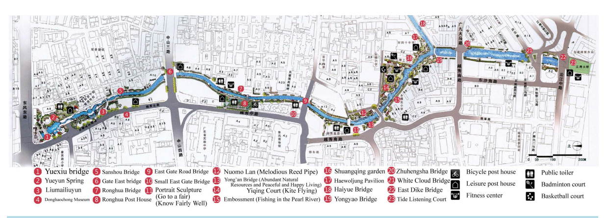
Figure 2. Distribution of existing supporting facilities and landscapes at open channel section of Donghaochong.