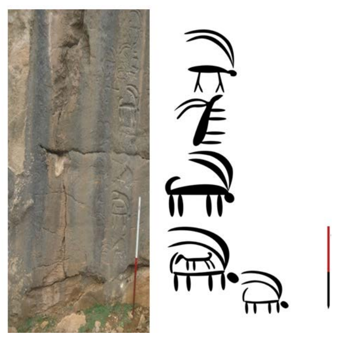
Figure 2. Ibexes in complex 1 at Tang-e Birzal.

In a 5 meters away from the complex 1, there is another brown-orange rock with the goat picture again, but its face has severely damaged as such that its reliefs have disintegrated, nevertheless we can see a folk of the mountain Ibex. These reliefs are like reliefs of the complex 1, but these samples have longer ancientness. In fact, these reliefs have created by the scratching or hitting styles and they have a 1 - 2 mm depth and 0.5 - 2 cm width. These Ibex have linear hands and feet, longed bodies, bow-like and big horns, hung down heads and face toward to the southern point. It is worthy to note that the two Ibex are bigger than other ones, this maybe has a special concept or the artist would like to make a variety (Figure 4).