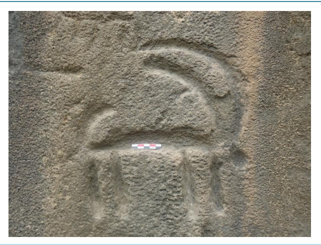
Figure 3. Ibex in complex 1.