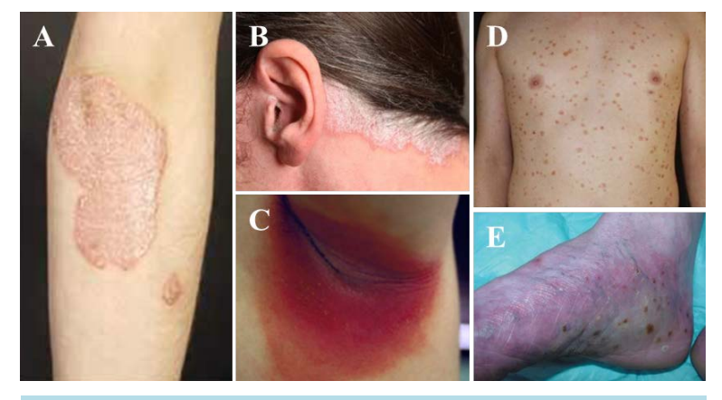
Figure 1. Clinical phenotypes of psoriasis. Plaque psoriasis is characterized by erythematous cutaneous lesions covered by silvery scales, often appearing on the elbow [26] (A). Plaque psoriasis may also develop in the scalp, named seborrheic psoriasis [27] (B). Flexural (inverse) psoriasis is distinguished from others by its reddish plaques without scales located in intertriginous areas [28] (C). Guttate psoriasis [29] (D). Pustular psoriasis (palmoplantar pustulosis) affects the palms and/or soles [30] (E).

Over the decades, the understanding of the disease, although still incomplete, has evolved, and enabled to offer patients a better diagnosis of their psoriasis and, by extension, to offer them the best treatments for their specific type of psoriasis. Although there are no diagnostic criteria for psoriasis, a classification of psoriasis has been proposed to assist practitioners, based on the clinical phenotypes of psoriasis, because it is known today that there are several varieties of clinical occurrence. Indeed, psoriasis, such as described above, can be variable in morphology, distribution and severity. Thereby, this classification of clinical phenotypes relies on various characteristics of psoriasis. Among these are the anatomical sites exposed to lesions, the distribution of the psoriatic