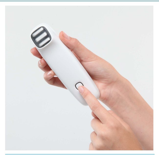
Figure 1. The HST home-device.

mal end point for prolonged periods of time, minimizing "hot spots" and patient discomfort, optimizing dermal matrix response, wrinkle reduction, and laxity improvement. There are 5 power levels that are chosen by the operator according to comfort. Levels 3 - 5 are emitting 5 watts, 10 watts, and 15 watts RF, respectively. In addition there is heating via a red spectrum LED. When the epidermal temperature reaches the end point temperature (41°C - 43°C in levels 3 -5, respectively), the device senses this temperature and the RF energy is inactivated. Once the temperature falls below the end point temperature, the RF is turned back on again. This cycle will continue as long as the operator wishes to maintain this soft tissue thermal end point. Thus, temperature end point is achieved quickly, well controlled and safely sustained. Additional safety features include the ability of the impedance sensors to detect when the dermal temperature is rising too quickly and the dermal impendence drops suddenly, resulting in the RF energy to be shut-off automatically. Conversely, if the electrodes stray off the skin, the impedance rises too high and the RF is shut-off (limiting RF arching or poor contact discomfort).