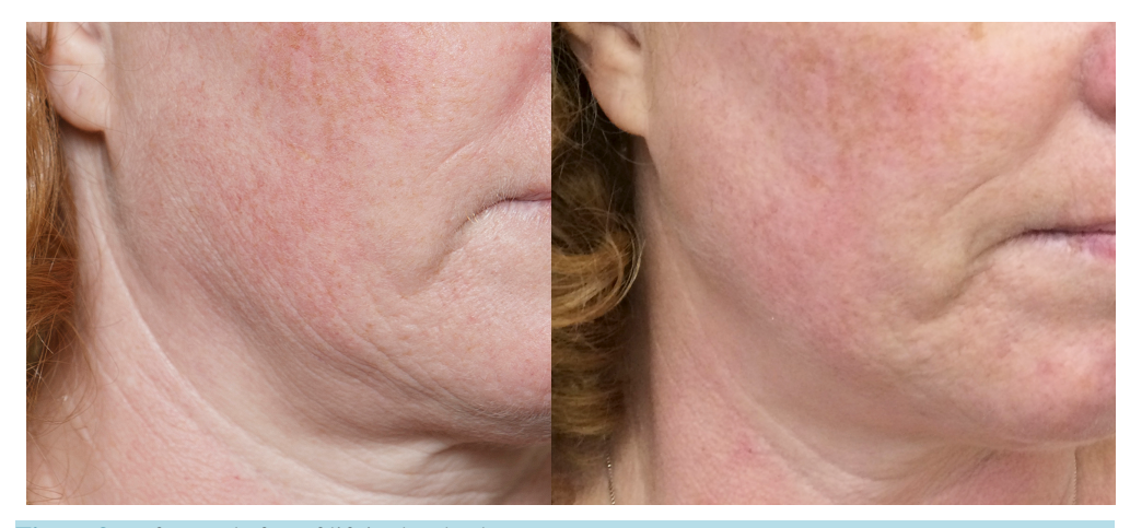
Figure 3. Before and after of lift in the cheek area.