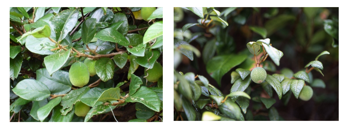
Figure 1. Appearances of two fig species used in this study. Left: Ficus pumila , right: F. thunbergii . Both photos were taken at Okinoshima, Kochi, western Japan.

Okinoshima is located off the shore of Kochi Prefecture, Shikoku, western Japan ( Figure 2 ). We collected samples of F. pumila and F. thunbergii for analysis in 2010. Each sample was collected at least 50 m from neighboring samples to avoid resampling the same genets. Because not all individuals had syconia at the sampling time, we checked the morphological characteristics of leaves for exact identification of the two species when we collected samples: i.e. , almost glabrous on the abaxial side and a lateral nerve angle of less than 40° for F. pumila , and pubescens on the abaxial side and a lateral nerve angle of more than 50° for F. thunbergii [17]. In total, 42 individuals of F. pumila and 2 individuals of F. thunbergii were collected. Voucher specimens were deposited at