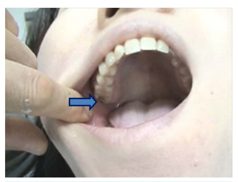
Figure 4. The arrow is pointing to the gold alloy inlay in the subject's tooth. The inlay was used to restore the dental caries on her right upper second molar