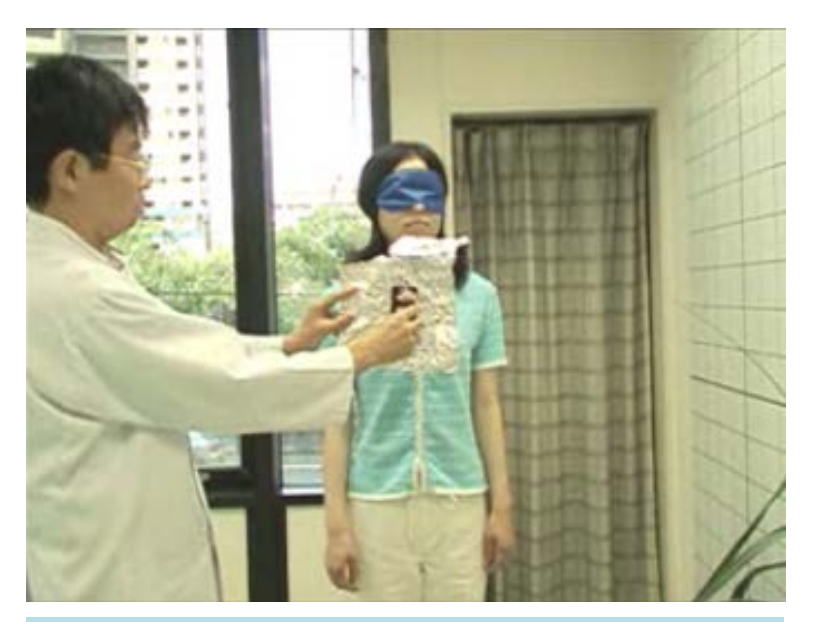
Figure 1. A cell phone was held about 1 m away from the blindfolded subject and aluminum foil was placed between the subject and a cell phone to shield the subject from the electromagnetic waves emitted by a cell phone. The subject's posture was normal.

The involuntary movements stopped when the aluminum foil shielded the subject from the phone. The experiment was repeated twice and the results were similar for both tests. The subject began to lean to the left and right when the aluminum foil shielding was removed, but stopped when the shielding was replaced. The results of this experiment indicate that the subject was suffering from EHS. However, the mechanism underpinning EHS is unclear. The subject did not have any implanted materials, such as dental fillings or metal cores, to attract electromagnetic waves from devices, such as cell phones. Therefore, the author attempted to neutralize the harmfulness of the electromagnetic waves entering the subject's body by using a gold alloy as previously shown [16]. The subject had small dental caries in her right upper second molar. The author removed the caries but it was not adequate to solve the patient's symptoms problem. A week later, the author placed a gold alloy inlay containing Au 86% and Pt 11.8% (Figure 3) over the tooth to restore the tooth after treating the dental caries