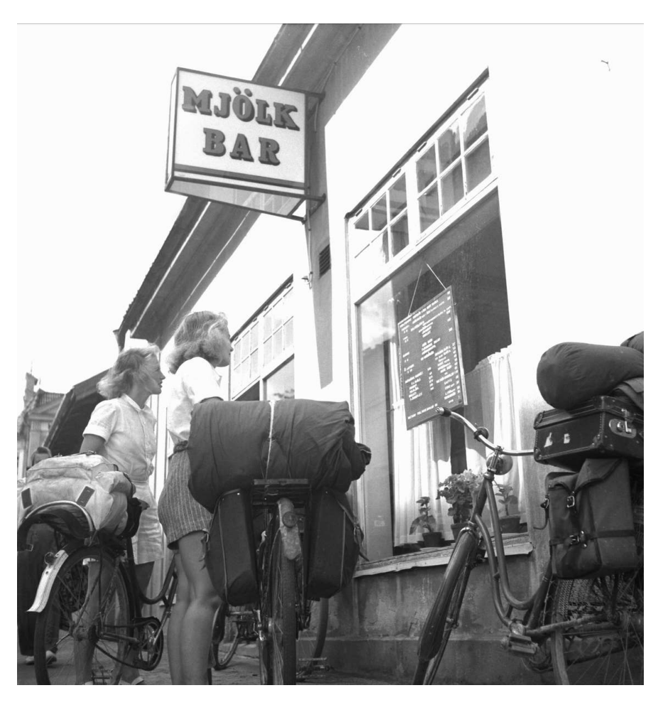
Picture 7 Two young Swedish women on a pause in front of a restaurant during summer holiday in the 1940s.

in the evenings and at weekends and, from the 1930s, also during holidays in summer time. Long weekend bike rides together with some other young people are mentioned in many cases, both in Norway and Sweden. The two-week vacation in 1936 in Norway [6] (three weeks in 1947), and in 1938 in Sweden [7,8] (three weeks in 1951) meant that cycling tours could be arranged over several days with overnight stays under simple conditions in barns or in hostels. In some cases, cyclists were able to hitch-hike with trucks for some distances and get a rest from their strenous cycling. This was of particular value if cyclists had the wind against them as on the flat lands in Skåne and Denmark, for example (ULMA 30927, Uppland Province). Burning summer heat is also mentioned as being tiring. The scout movement arranged long bicycle tours. A diary preserved in southern Norway describes such trips with their heavy loads during the summer to Denmark (MO 1996 No. 4 Aust-Agder County).