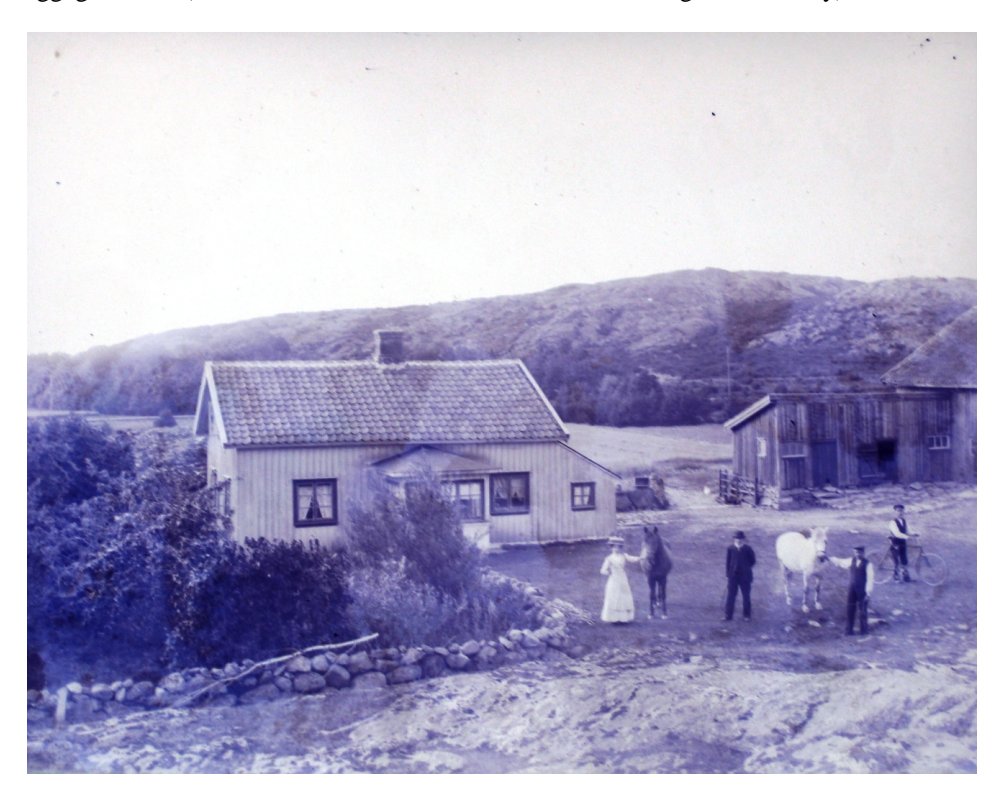
Picture 4 A farmer's family in western Sweden in the 1920s. The husband and wife each display one horse for the travelling photographer. The grandfather stands with his cane in the middle. The teenager son is placed in the background with his bicycle.

was the case especially among the horse owners. On a farm the horse was the primary means of transport for the elderly, whereas younger men tried to get a cycle (MO 1981 No. 100 Ryfylke, Rogaland County). A factor that played a significant role in the bicycle's childhood was when the bicycles were accepted in the peasant districts; they were useful to transport milk bottles to the milk trucks and dairies (MO 1981 No. 48, A man born in 1888, Østfold County). They were also used for trips to the local store where all items were hung on the handlebars or tied on the luggage carrier (MO 1981 No. 97, A woman born in 1907, Rogaland County).