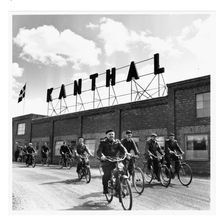
Picture 9 Factory workers cycling to and from their place of work in Stockholm during the Second World War.

When War ended, Norwegians were able to ride across the border to Sweden to find scarce goods, especially clothing fabrics. Private cars did not exist to any great extent in Norway until 1960 [9, p. 83, 10]. Swedish goods were liable to custom duties, but customs officials were often lenient when they saw that smuggling women had wrapped several layers of fabrics around their bodies as they passed through customs on their bicycles. On the