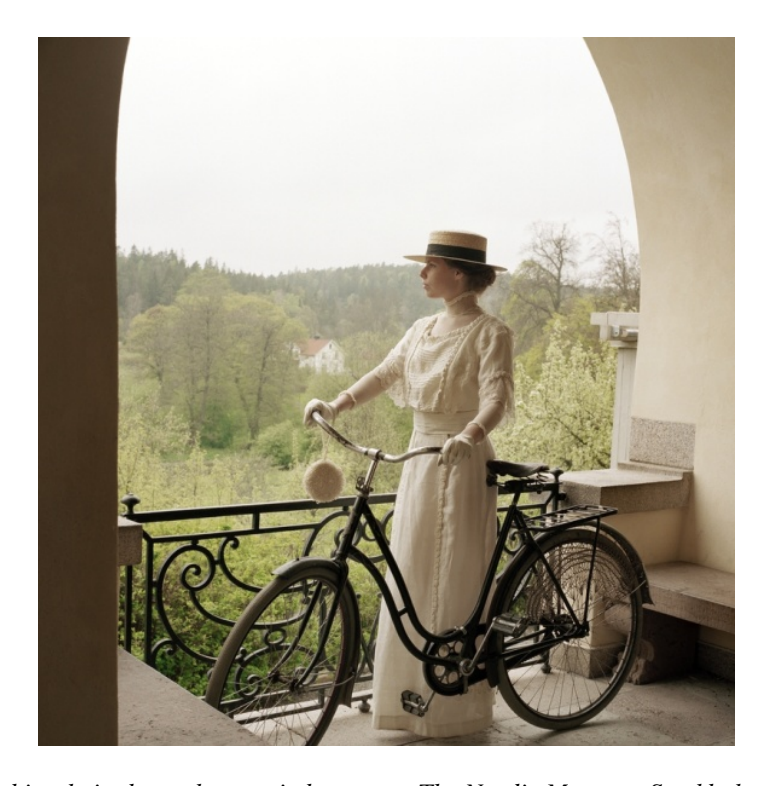
Picture 6 A lady's bicycle in the early twentieth century. The Nordic Museum, Stockholm.

Lady's bicycles came somewhat later than men's bikes, but they were not uncommon in the 1920s in Norway and Sweden (ULMA 26747, Uppland Province). Women needed a chain-guard to prevent their dresses and skirts from getting caught in the chain. Trousers were not considered appropriate for women to wear during the early 1900s. Stories are told about skirts being tied together and pulled up with help of a belt when riding a bike (MO 1981 No. 52, Rogaland County).