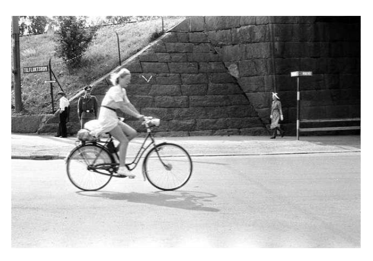
Picture 8 A woman cycling in Oslo in 1941. A Nazi soldier in the background. Photo Anders Beer Wilse, The Norwegian Folk Museum, Oslo.NF.WF 15116.

neighbouring countries. A woman, born in 1930 in Hovås in Gothenburg, remembers how one had to carry clothing and household utensils on the luggage carrier when going to a summer home. Bicycles could then be so back-heavy that they could even rear (DAGF 1511 Gothenburg). In Norway, in addition, cycling out of the cities during weekends was aimed at trying to buy food in rural areas. This was an illegal black market action hidden from the German authorities (MO 1996 No. 17 Østfold County), who carried out checks on the contents of luggage on bikes. Such bicycle rides often took place at night (MO 1996 No. 31, A man born in 1909, Oslo).