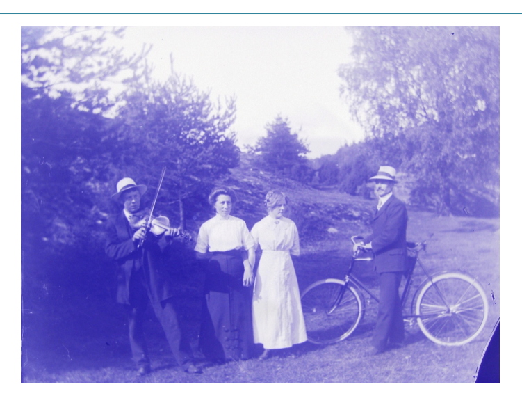
Picture 5 A young man who rode his bicycle to a dance pavilion in western Sweden.