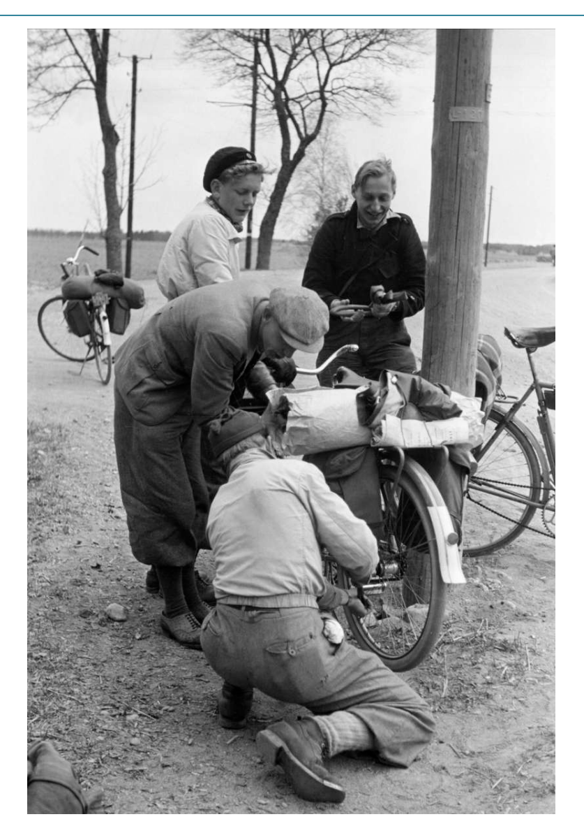
Picture 10 A punctured rear tyre during a summer excursion in 1940. The Nordic Museum, Stockholm. Number 0039680.