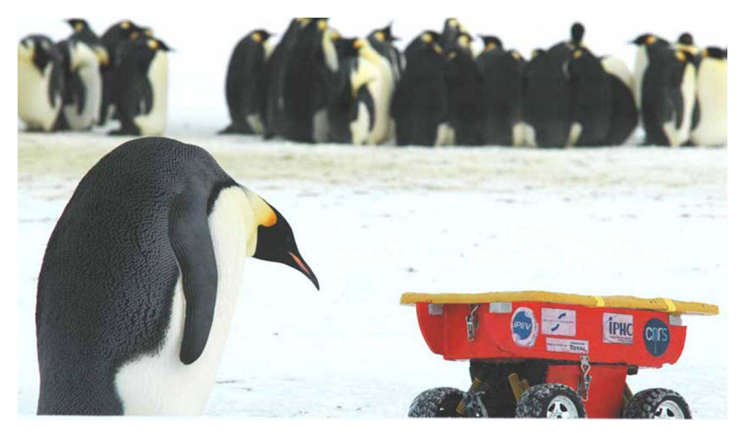
Figure 4. UGV deployed at Dumont D'Urville, Adélie Land, Antartica to perform observations of breeding Emperor penguins ( Aptenodytes forsteri ).

Lab robots, which allowed sequencing the human genome, are also involved in ecological experiments which require several million repeated measurements [31]. These robots have not only been designed to perform laboratory tasks endlessly and with great precision [32], they have been built with sufficient artificial intelligence to independently design hypotheses, test them using their own empirical data [33], and eventually to design and replicate themselves [7]. Further, robots can be used to experimentally test evolutionary theory: robotics reconstructions of dinosaurs have helped assess how fast these extinct creatures might have run according to their putative morphological characteristics [34], and 500 generations of robots were used to test the importance of relatedness on communication performance [35]. Experimental behavioral Ecology is also a surprisingly active field of ecological robotics [36]. Here, individual or