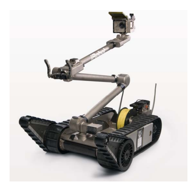
Figure 1. Morphology of an UGV (iRobot<sup>®</sup> 510 PackBot<sup>®</sup>). This small ROV ( 88.9 \times 52.1 \times 17.8 cm; 10.89 kg without batteries) can be used on a great variety of terrain (image courtesy iRobot<sup>®</sup>).

In terms of onboard equipment, scientific robots are designed with two distinct modules (Figure 1). The first set, which can be found in any robot, allows the unit to function more or less independently in its working environment. The core of this module is a positioning system, which is often a GPS receiver, except underwater where it might be replaced by acoustic signals. Such positioning is further refined by 3D motion sensors, and confronted with fine-scale mapping of the environment (for instance via RADAR or LIDAR) to yield decisions on where to and how to move. Beyond this navigation module which steers propulsion systems, robots carry tools designed for acquisition of ecologically relevant information [6]. These sensors include: 1) Optical sensors operating in a spectrum from infrared through visible to ultraviolet light. They are used to model the robot's environment, to identify and take a census of organisms of all sizes, and to record a variety of parameters such as surface temperatures, or underwater light attenuation. 2) Additional physiccal sensors, the most common being temperature, pressure, humidity and conductivity sensors. 3) Acoustic sensors, which are mainly used underwater to assess current features, but also to map organisms. 4) Chemical sensors, such as pH sensors or tools to detect a great variety of gases, especially O2 and CO2.