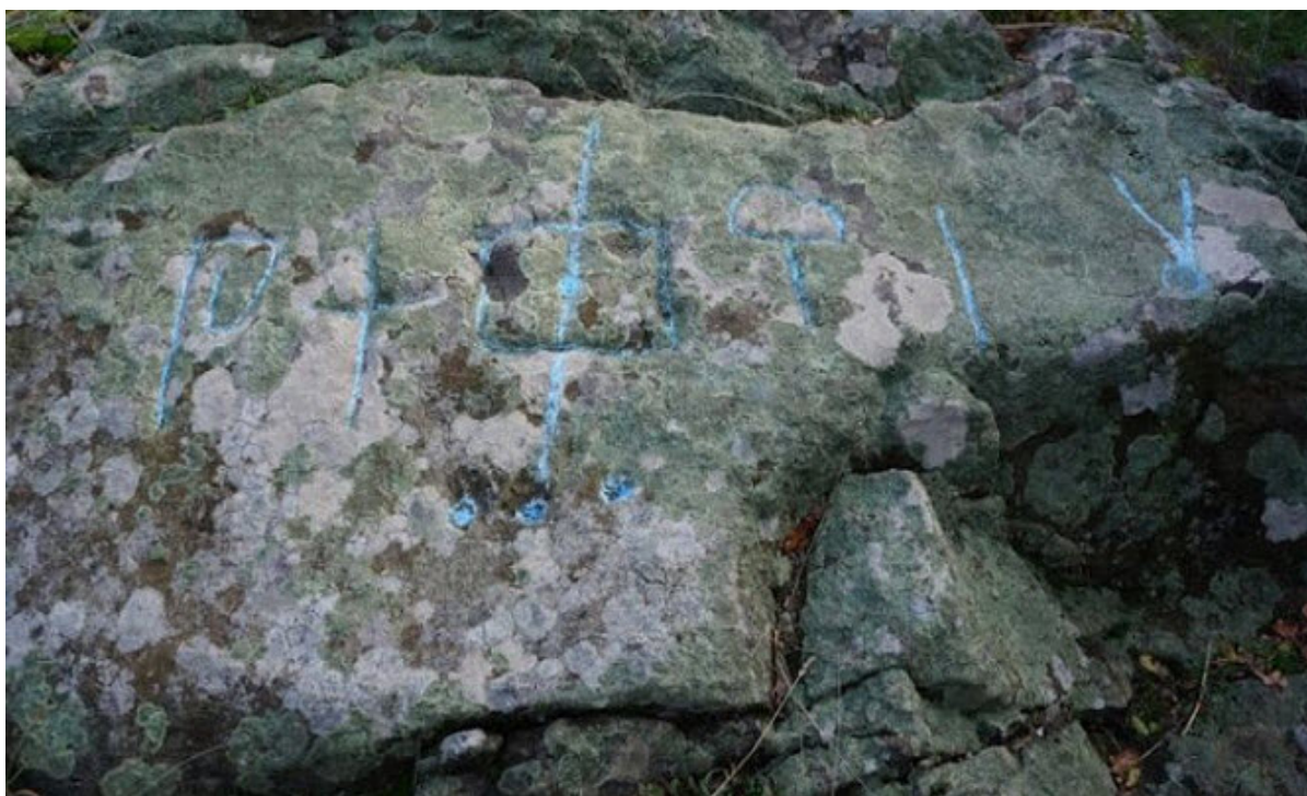
Figure 1. Rock hosting the inscription of Parvomai (Kmeta.bg., 2016).

The first character of the inscription corresponds perfectly to a character of the inscription on the plate of Gradeshnitsa dated to the 5 th millennium BC. The second character corresponds to a character on an artifact from Valchi Dol dated to the 5 th millennium BC. This character can be found also among the characters of the Magura cave, which according to some researchers could be dated to the 5 th millennium BC. The third character