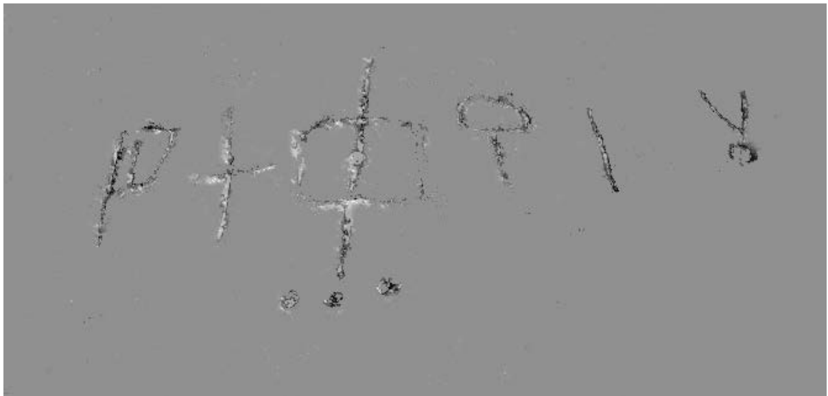
Figure 2. Layout of the inscription of Parvomai.